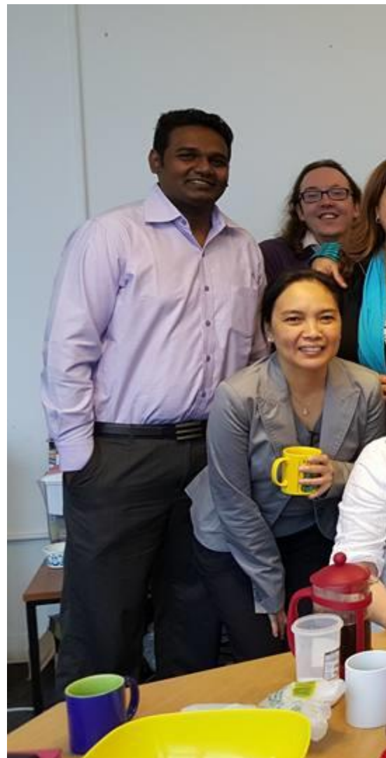
WSCF appoints new General Secretary